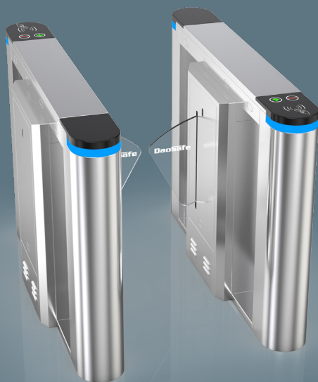
Model No. DS312

Material: 304 stainless steel Size: 1200 * 220 * 1000mm Net weight: 60kg/pcs Pass rate: 45 person/min Pass width: 550mm