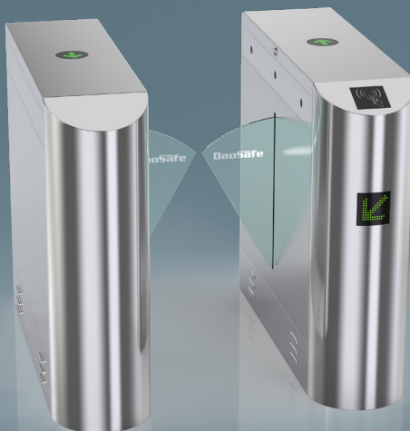
Model No. DS302

Material: 304 stainless steel + plexiglas Arm Size: 1200 * 300 * 980mm Net weight: 65kg/pcs Pass rate: 45 person/min Pass width: 550mm