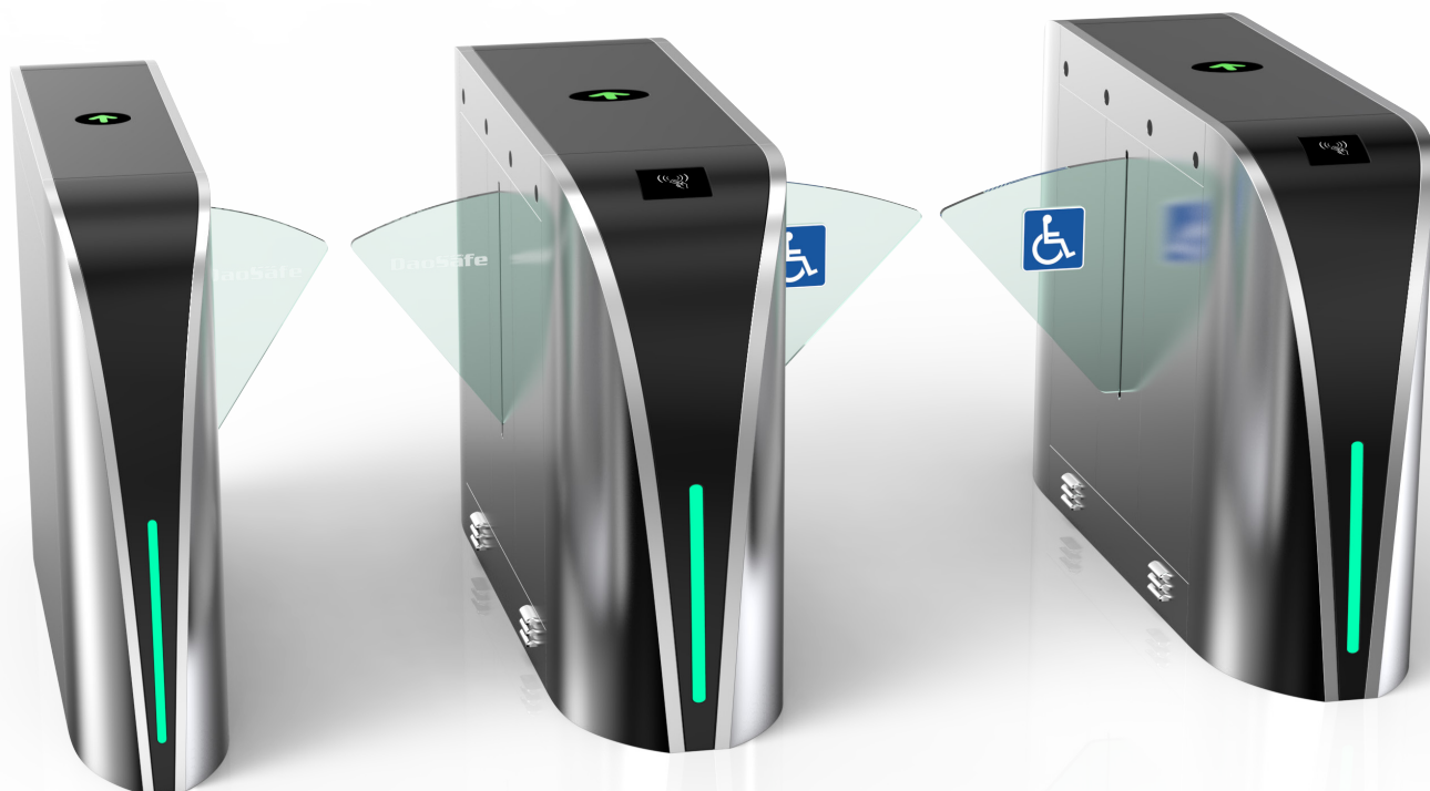
Model No. DS3000