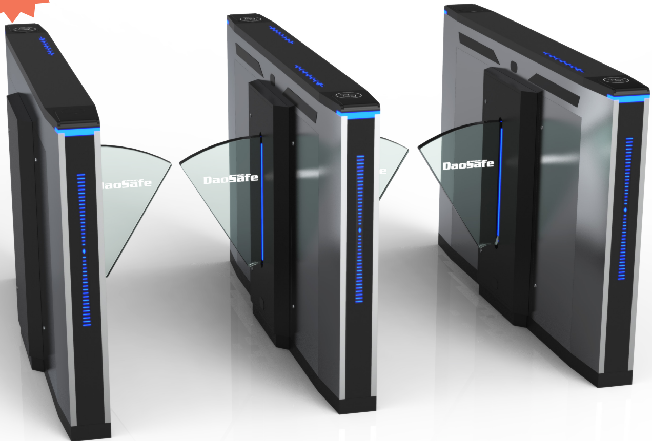
Model No. DSN-30