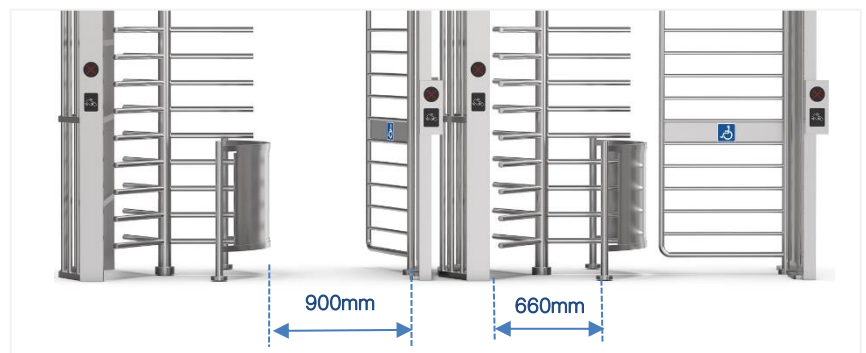
660mm For Pedestrian, 900mm For Wheelchair