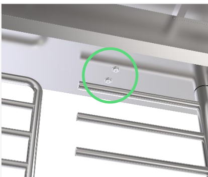
Manually Control Entry Direction