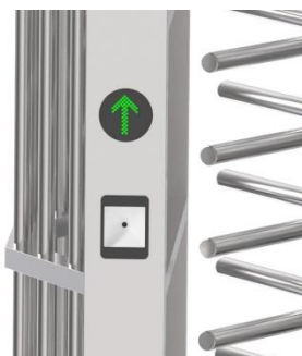
QR/Bar Code Solution